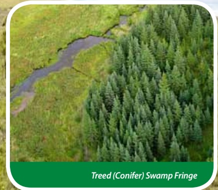
Treed (Conifer) Swamp Fringe