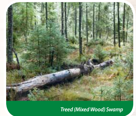
Treed (Mixed Wood) Swamp