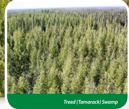
Treed (Tamarack) Swamp